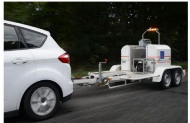
Remorque H/FWD tractée